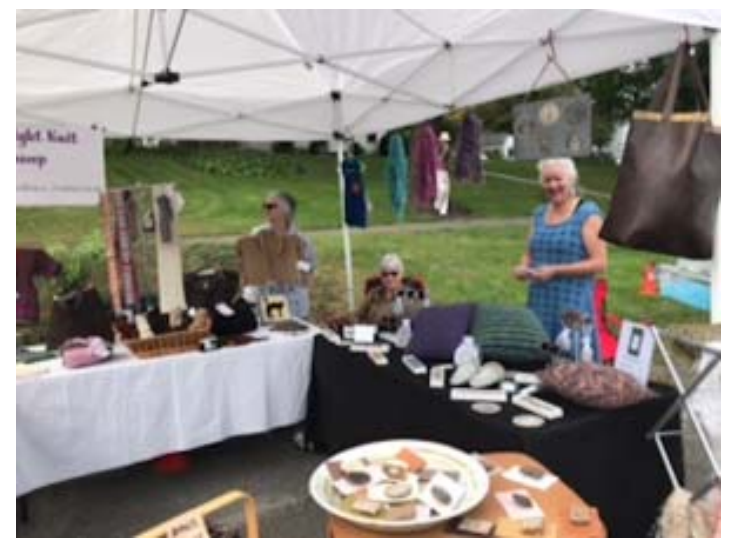
Tight Knit Group will join us at the Fiber Fest

All weekend natural dying will be on show. Onions, acorns, rosemary and spinach are only a few of the natural materials that can be used. For centuries leaves, roots, bark, berries, flowers and vegetables, lichen and insects